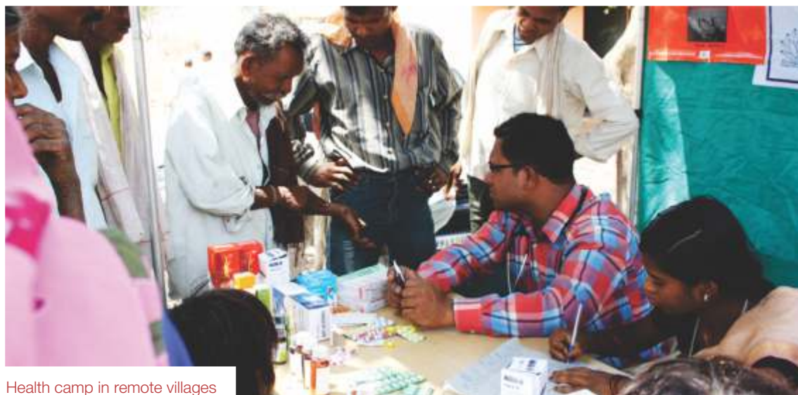
Health camp in remote villages

Often a beginning in the right direction is what it takes to overcome a mammoth issue. Child health can be improved only through increased awareness and provision of adequate services. We are steadfast in our commitment. After all as it is said; it is not important where we stand, what is important is the direction in which we are headed.