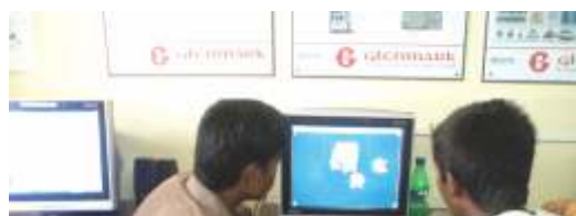
Students learning computer at Yuva Parivartan (YP) Center

Our NGO partner implementing the program is : Kherwadi Social Welfare Association (KSWA), Nashik