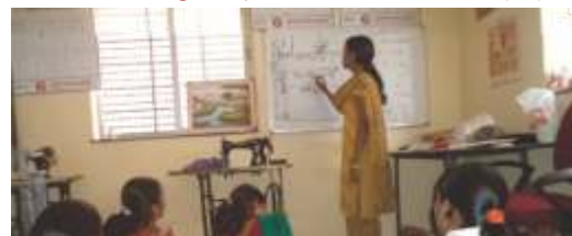
Tailoring class for girl students at the YP center