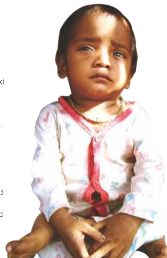
Pavan after intervention