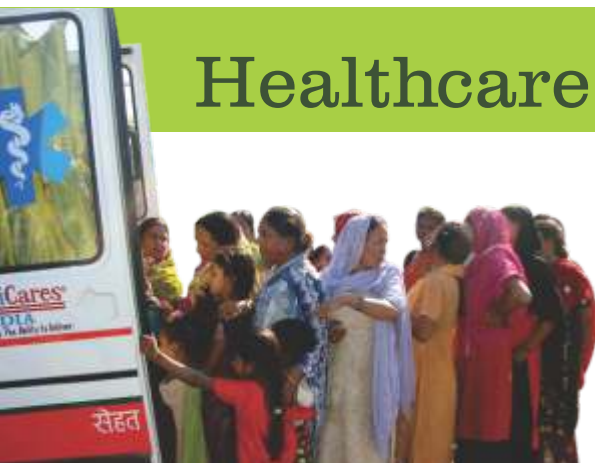
Americares ( India) giving medicines at health camp, Deonar, Mumbai