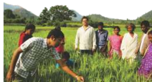
Farmers are being taught scientific method of cultivation

We have skilled 646 school drop outs (Nashik), helped in rehabilitation of around 2800 differently-abled individuals (Jaipur) and trying to ensure food security of 2000 tribal families (Rayagada, Odisha)